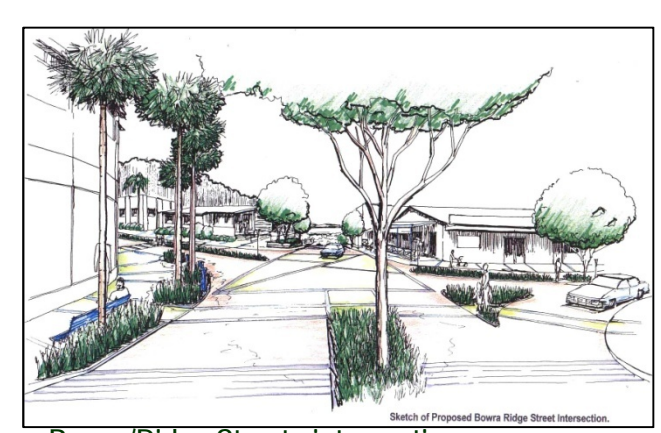
Bowra/Ridge Streets intersection, Nambucca Heads.

Sovereign Hills town centre lakes, redesign.