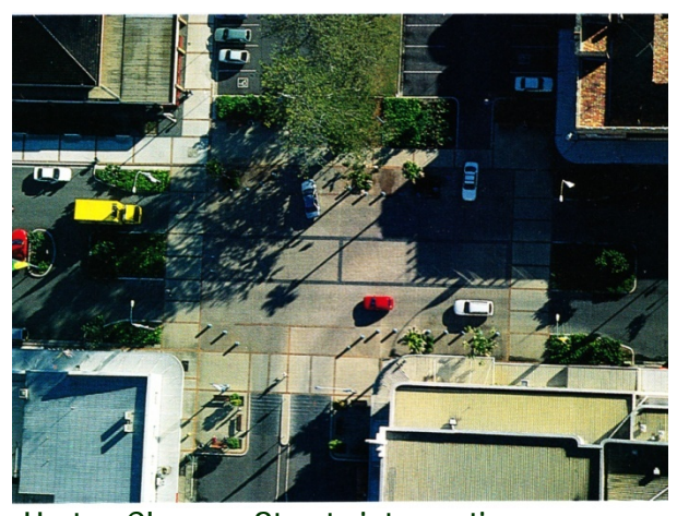
Horton Clarence Streets intersection.